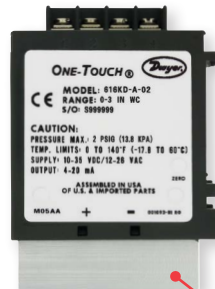
Optional NPT Connection Block