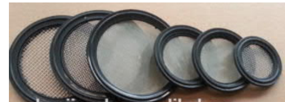
seal with screen(60-200mesh)