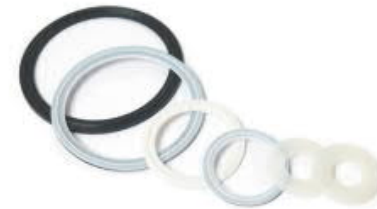
EPDM, Silicone, NBR, PTFE, Viton, Nirtle