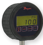
DPG-100 with Protective Rubber Boot