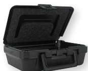
Protective Carrying Case