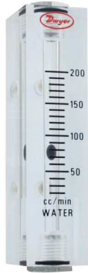
VFA with EC (connessioni in linea verticali)