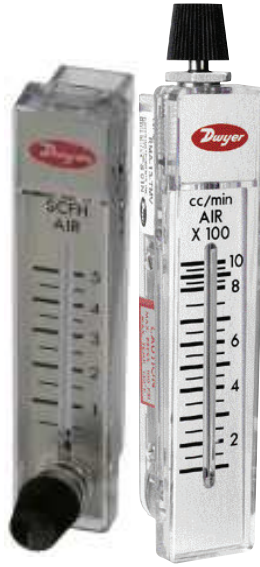
Modello RMA Scala alta 50mm