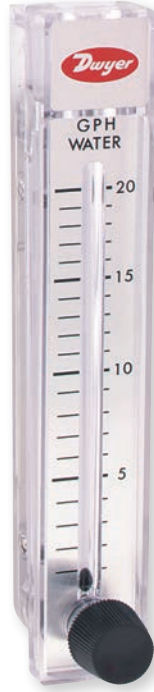
Modello RMB Scala alta 125mm