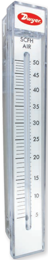
Modello RMC Scala alta 250mm

Su ogni modello (RMA/RMB/RMC) è disponibile anche la versione con valvola, e a vostra scelta se su ingresso o su uscita